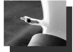
A small solid mercury amalgam ball is easily and safely snapped off for recycling. Magnets are recyclable metal and the remainder of the bulb is disposable glass.

Typical metal halide and sodium lamps have a bulb life of less than 10,000 hours while LEDs may last 20,000 hours. This means Golf-Bright™ fixtures last 1,000%... ten times longer than high intensity discharge (HID) technologies and 500% longer than most LEDs. When considering labor and inventory overhead associated with maintenance, overall savings average 600%. Equally important, there is no dispersed mercury which means no special handling . The solid amalgam slug is removable and recyclable.