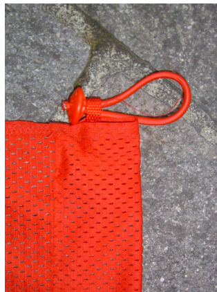
Fig. 2: Bungee strap

Judgement: The panel meets the specifications required by the FIS. The certification is valid till 30.4.2010.