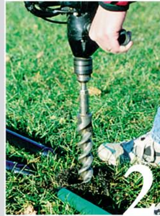
Drill holes into turf.