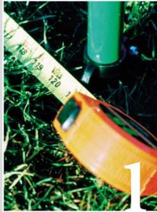
Establish pole locations.