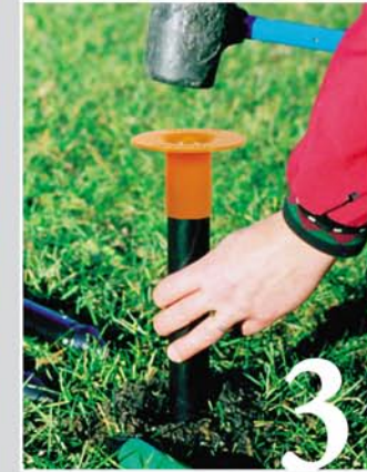
Insert anchors (if necessary).